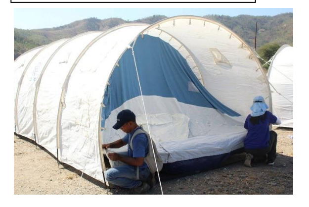
DRR exhibition on United Nations Day