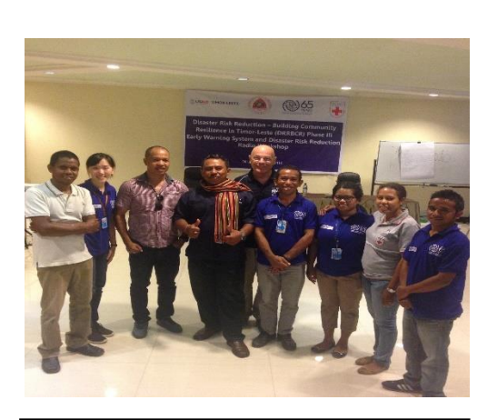
IOM holds Early Warning System and Disaster Risk Reduction workshop for committees from 7 municipalities