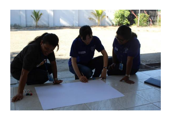
IOM staff training for Disaster Risk Assessment