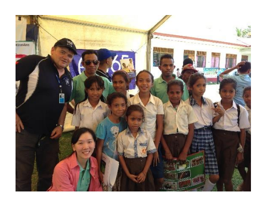
Exhibition of IOM on the International Day for Disaster Risk Reduction