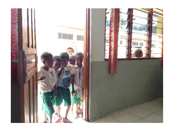
School Education about DRR in Manatuto