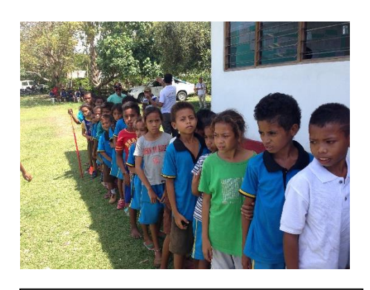
Teach the children to queue up