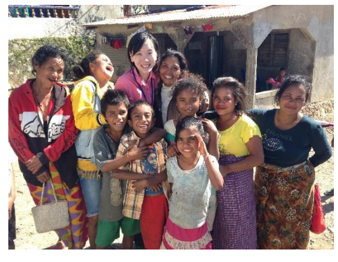
Timorese women face a lot of problems but still keep a very beautiful heart