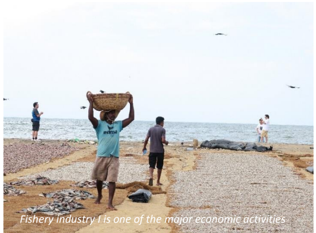
Fishery industry is one of the major economic activities