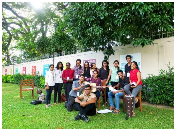
I am inspired by the community projects they proposed during the programs. Learning about the concept of "Locally Engaged, Globally Connected", this group of young people is working hard for their own community.