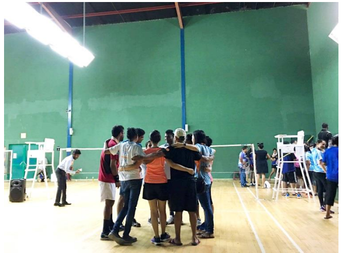
Luckily, I got the chance participating in the inter-agency badminton tournament. The practice after work and the cheer from each other has strengthen our bonding.