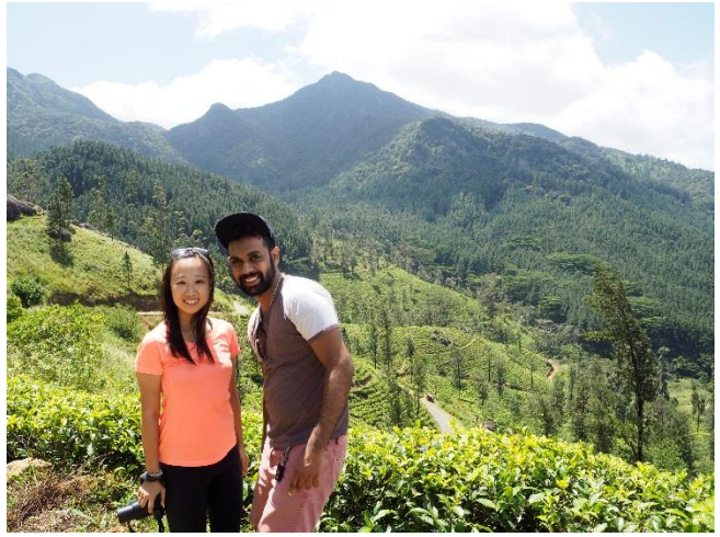
Waking up at 4 om, my colleague drive me to explore his country. The homemade sweet and tea from family run stall right next to the waterfall. The river where you can hangout with your friends freely during the lazy weekend. Walking with barefoot to feel the temperature of rock and river. I feel another side of Sri Lanka