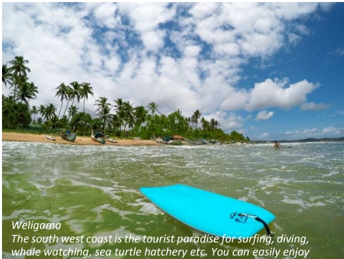
Weligama The south west coast is the tourist paradise for surfing, diving, whale watching, sea turtle hatchery etc. You can easily enjoy