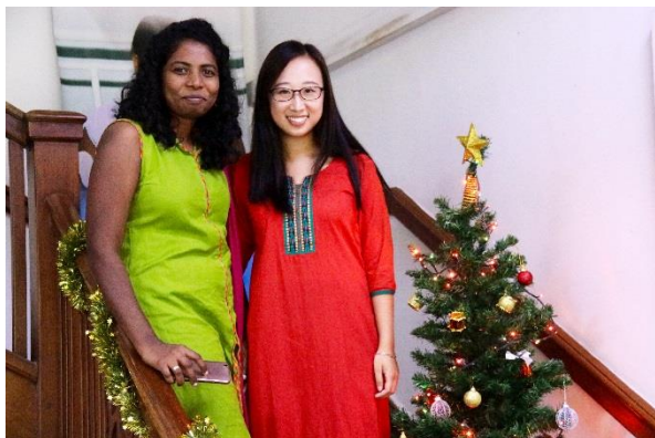
Dressing up in green and red Sri Lanka custom, celebrating the Christmas in office. I have tasted different style cuisine, e.g. Sri Lankan, Hindu, Muslim, in the office as colleagues always share the joy with others in office after celebrating their religious festival.