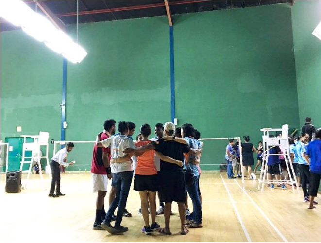
Luckily, I got the chance participating in the inter-agency badminton tournament. The practice after work and the cheer from each other has strengthen our bonding.