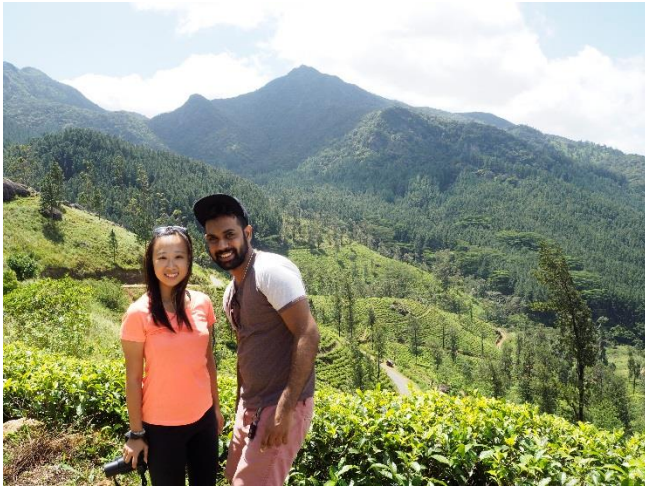
Waking up at 4 am, my colleague drive me to explore his country. The homemade sweet and tea from family run stall right next to the waterfall. The river where you can hangout with your friends freely during the lazy weekend. Walking with barefoot to feel the temperature of rock and river. I feel another side of Sri Lanka