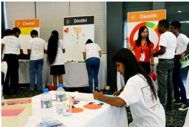
Learning from the youth who gathered for the final competition of Ivoice, the first tri-lingual platform encouraging youth to exchange idea and solutions, from different part of Sri Lanka caring various social issues.