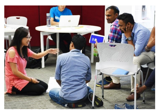
Exchanging ideas with Active Citizen Program's youth participants