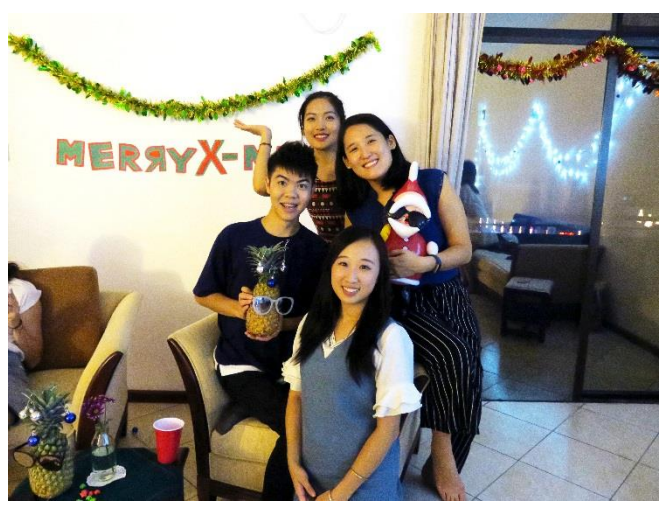
My family in Sri Lanka. We held a potluck Christmas Party in our home with other UNVs in Sri Lanka.

We cooked, travelled, laugh and smile together. I'm grateful to have them shared the struggled and insight with each other.