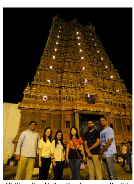
Visiting the Nallur Kandaswamy Kovil in Jaffna with colleagues. I started to experience and learn about the culture and history of Sri Lanka during the field mission with the sharing by my colleagues.