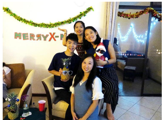
My family in Sri Lanka. We held a potluck Christmas Party in our home with other UNVs in Sri Lanka. We cooked, travelled, laugh and smile together. I'm grateful to have them shared the struggled and insight with each other.