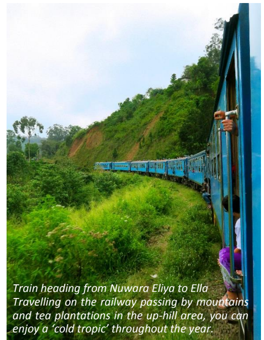
Train heading from Nuwara Eliya to Ella Travelling on the railway passing by mountains and tea plantations in the up-hill area, you can enjoy a 'cold tropic' throughout the year.