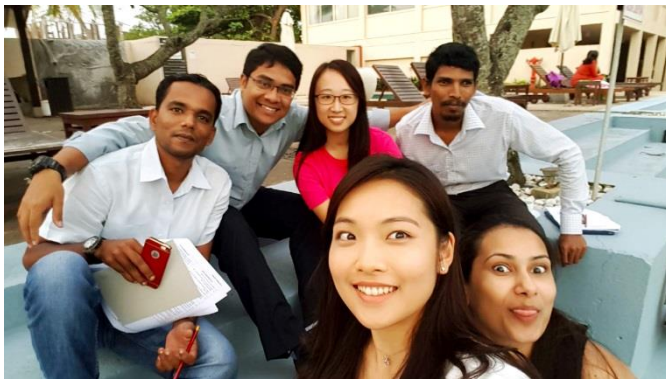
Learning with my funny friendly teammates in retreat.