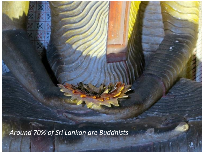
Around 70% of Sri Lankans are Buddhists