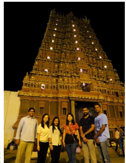
Visiting the Nallur Kandaswamy Kovil in Jaffna with colleagues. I started to experience and learn about the culture and history of Sri Lanka during the field mission with the sharing by my colleagues.

Distributing leaflet in front of the fort station for the international campaign '16 Days of Activism' with the theme of 'Elect Her, End Violence' which is responding to the Sri Lanka provincial election in Feb 2018.