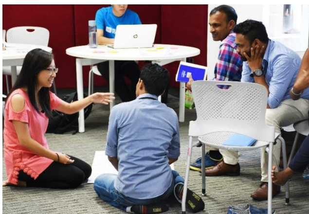
Exchanging ideas with Active Citizen Program's youth participants