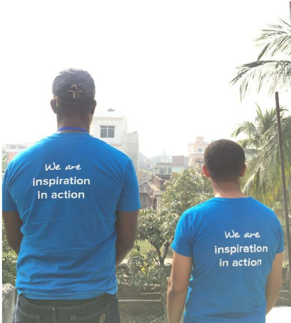
UNV on Assignment in Nepal

3. Support Administration: I assisted in the coordination of recruitment formalities, volunteer induction, and orientation. Daily administrative work included helping volunteers with their entitlements, arranging for volunteers' arrival and repatriation. My work helped the incoming volunteers to adapt to the new life in Nepal.