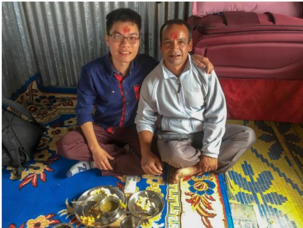
Field trip with a service recipient who benefits from the work of UN Volunteers.

Field experience: During my assignment in Nepal, I had the opportunity to visit several fields, where the UN volunteers in Nepal are serving the service recipients in the rural area. I had the chance to talk to the local tribes and encountered various interesting customs. The local people were friendly to my visit and they welcomed me with smiles and a lot of delicious local food. I also understood their difficulties after the 2015 Earthquake. In the following pictures, I met a family whose house was completely destroyed because of the earthquake. Until now, they couldn't afford to rebuild a concrete permanent house to host its 9 family members. Therefore, they constructed a simple shelter made of iron sheet and had been living in that house ever since.