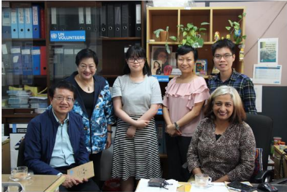
The picture with my supervisor and the AVS Hong Kong delegates in UNV Nepal office.