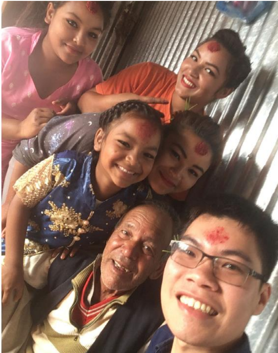
Field trip with a family of service recipients