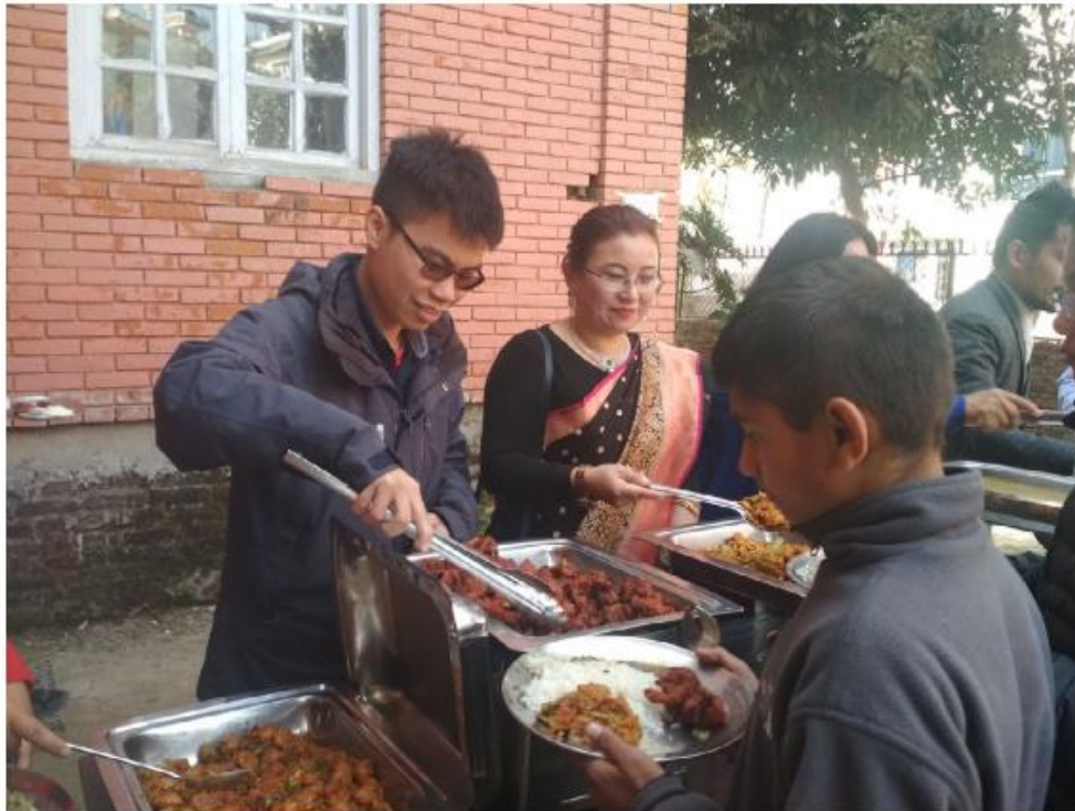
Serving local youth in a UN event

Major Learning: I acquired a set of skills, which will empower me for the future career. I sharpened my leadership skills by organising different events, initiative a project that involves various stakeholders and coordinating with external partners on issues regarding volunteerism in Nepal. Moreover, I acquired many hands-on techniques on conducting media and communications work, including learning how to produce a quality video and edit excellent photos. I even learned to cooperate with colleagues from a variety of backgrounds. It's always interesting to get new exposure to a particular culture from your colleagues by acknowledging our differences.