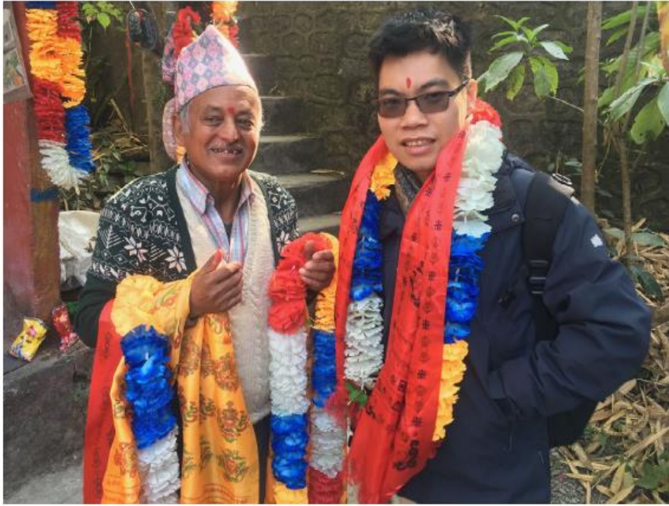
A Nepali elders demonstrates his friendliness.