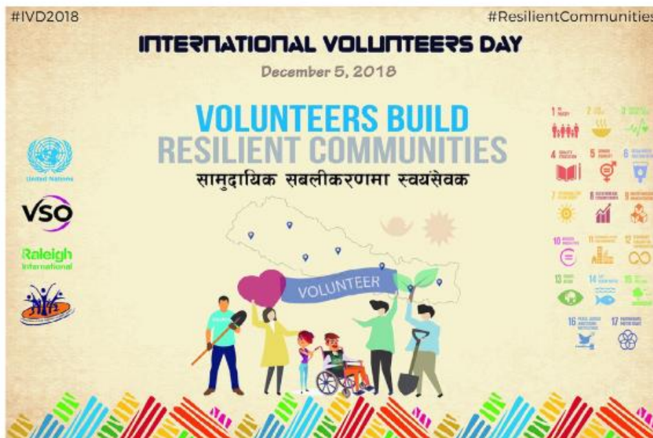
Banner of IVD 2018

1. Support Programme Implementation and Monitoring: I supported the design, planning, and organization of specific events, including the International Youth Day (IYD), the UN Day and International Volunteer Day (IVD) in coordination with other UN agencies and partners. On IVD 2018, under the supervision of the UNV Programme Analyst in Nepal, I initiated a project to organise a one-day workshop, which happened concurrently in all 7 provinces.