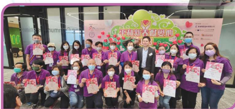
「平和新春獻愛心2023」義工探訪獨居長者 Volunteers visited singleton elderly in 'Love Action in Chinese New Year 2023'