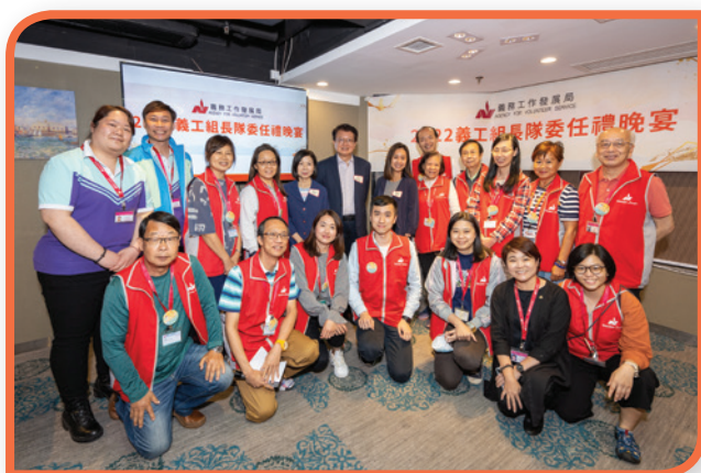
2022年組長隊委任禮晚宴 The 2022 Volunteer Leaders Team Appointment Ceremony

本局亦於2023年3月18日舉行組長隊委任禮晚宴，回顧過去一年的工作及總結服務經驗，委任和勉勵組長，感謝組長的付出及貢獻。