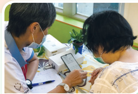
社區健康服務隊樂齡科技分隊隊員，教授長者使用智能手錶及設立手機應用程式帳戶，以便長者記錄每天步行路數、睡眠質素和心率 Gerontechnology sub-team members of the Health Care Team taught the elderly how to use smart watches and set up a mobile application that allows the elderly to track their daily steps, sleep quality, and heart rate