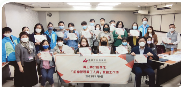
義工管理人員實務工作坊 Volunteer Management Workshop