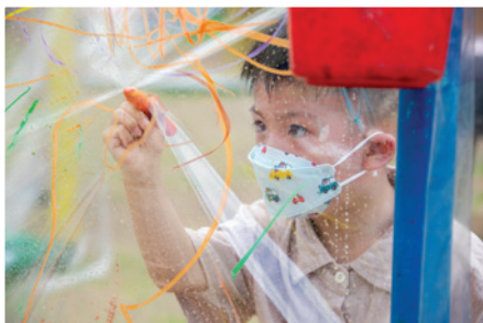
「專注」 'Concentration'