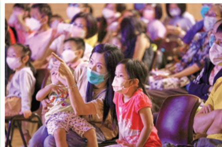
「親子樂融融」 'Joyful parent-child relationship'