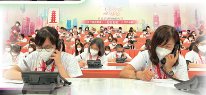
「萬眾同心公益金」2022 'Community for the Chest' Television Show 2022