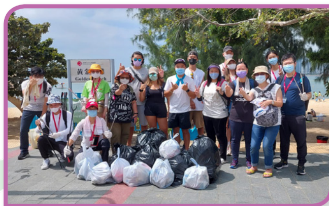
「Go Green Keep Clean快閃服務」義工進行沙灘清潔活動 Volunteers joined 'Go Green Keep Clean' service to clean the beach

On 18 March 2023, AVS hosted the Volunteer Leaders Team Appointment Ceremony banquet to thank volunteer leaders for their dedication and contributions, to celebrate the work achievements and to appoint volunteer leaders for the year to come.