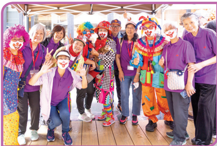
社區綜藝服務隊隊員為扭波攤位作準備 Members of the Volunteer Performance Service Team got ready for the balloon-twisting booth

In the coming three years, family and intergenerational volunteering would be a strategic focus of VTB. Parents are encouraged to be the role model in volunteering for their children. In addition, with enhanced project image, more enthusiastic young people, the older people community (aged 50 or above; 50+) with specialized skills, and the retired would be engaged to join various volunteer teams.