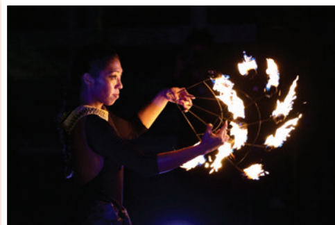
「火舞」 'Fire dance'