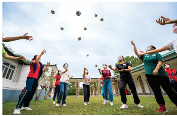
「齊創明天」 'Build a better future together'